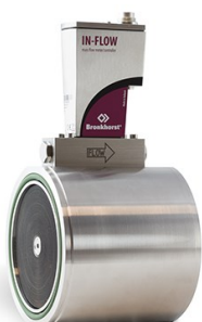
IN-FLOW 'HIGH-FLOW' F-106EI

Min. flow 8 ... 400 m 3 n/h Max. flow 80 ... 4000 m 3 n/h Pressure rating up to 40 bar Wafer type connection (DIN/ANSI) Rugged IP65 housing