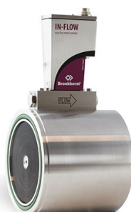
IN-FLOW 'HIGH-FLOW' F-106GI

Min. flow 8 ... 400 m 3 n/h Max. flow 80 ... 4000 m 3 n/h Pressure rating up to 40 bar Wafer type connection (DIN/ANSI) Rugged IP65 housing