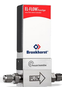
EL-FLOW PRESTIGE FG-110CP (P-INSENSITIVE)

Min. flow 0,14...7 mln/min Max. flow 0,4...20 lln/min Pressure rating 10 bar On-board pressure correction 100 selectable gases