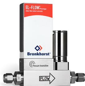
EL-FLOW PRESTIGE FG-210CVP (P-INSENSITIVE)

Min. flow 0,014...0,7 mln/min Max. flow 0,18...9 mln/min Pressure rating 100 bar On-board pressure correction 100 selectable gases