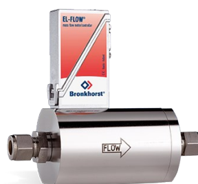
EL-FLOW SELECT F-113AC

Min. flow 0,4...20 l/min Max. flow 0,6...100 l/min Pressure rating 100 bar Compact design High accuracy