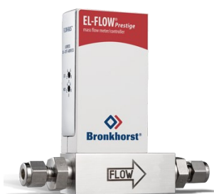
EL-FLOW PRESTIGE FG-111B

Min. flow 0,14...7 mln/min Max. flow 0,4...20 l/min Pressure rating 100 bar 100 selectable gases Customized I/O configurations