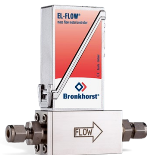
EL-FLOW SELECT F-111AC

Min. flow 0,14...7 mln/min Max. flow 0,4...20 l/min Pressure rating 100 bar 100 selectable gases Customized I/O configurations