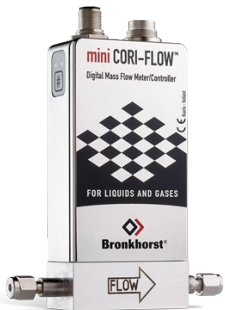
MINI CORI-FLOW™ M12