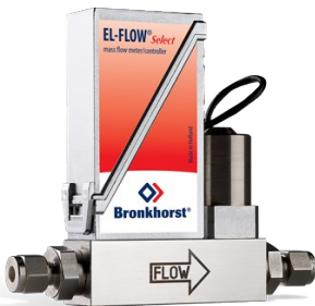
EL-FLOW SELECT F-201CV