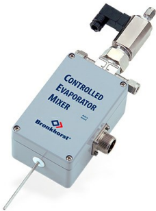
CEM EVAPORATOR W-202A

This coating system works very stable. In fact, this CEM system anticipates to the expectation that liquid precursors will become more important in this type of deposition processes. It may also be interesting for the semiconductor industry , to apply a very thin passivation layer that prevents unwanted interactions between the tiny structures.