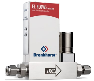
EL-FLOW PRESTIGE FG-210CV

Min. flow 0,14...7 mln/min Max. flow 0,4...20 lln/min Pressure rating 100 bar On-board pressure correction 100 selectable gases