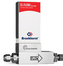
EL-FLOW PRESTIGE FG-111BP (P-INSENSITIVE)

Min. flow 0,14...7 mln/min Max. flow 0,4...20 lln/min Pressure rating 100 bar On-board pressure correction 100 selectable gases