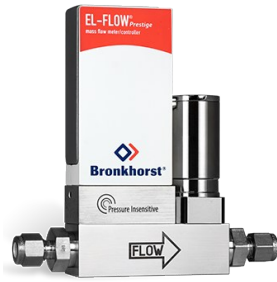
EL-FLOW PRESTIGE FG-211CVP (P-INSENSITIVE)

Min. flow 0,014...0,7 mln/min Max. flow 0,18...9 mln/min Pressure rating 10 bar On-board pressure correction 100 selectable gases