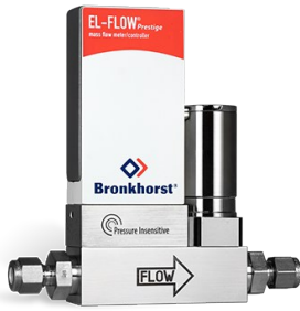
EL-FLOW PRESTIGE FG-200CVP (P-INSENSITIVE)

Min. flow 0,014...0,7 mln/min Max. flow 0,18...9 mln/min Pressure rating 10 bar On-board pressure correction 100 selectable gases