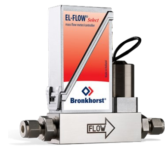
EL-FLOW SELECT F-201CV