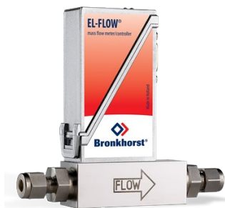
EL-FLOW SELECT F-111B