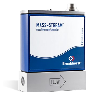
MASS-STREAM D-6341 MFC

Min. flow 0,14...7 l/min Max. flow 1...50 l/min Pressure rating up to 20 bar Rugged sensor and housing (IP65) Optional integrated TFT display