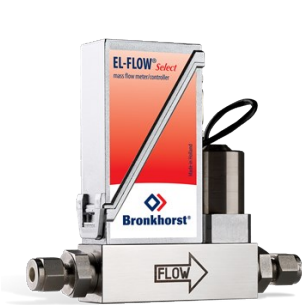
EL-FLOW SELECT F-200CV

Would you like more information about the thermal technology?