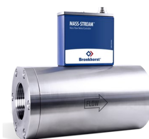
MASS-STREAM D-6390 & D-6490 MFM

Min. flow 1...50 l/min Max. flow 5...500 l/min Pressure rating up to 20 bar Rugged sensor and housing (IP65) Optional integrated TFT display