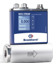
MASS-STREAM D-6370A & D-6470A MFM

Min. flow 4...200 l/min Max. flow 20...2000 l/min Pressure rating up to 20 bar Rugged sensor and housing (IP65) Optional integrated TFT display