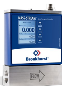
MASS-STREAM D-6360A & D-6460A MFM

Min. flow 4...200 l/min Max. flow 20...2000 l/min Pressure rating up to 20 bar Rugged sensor and housing (IP65) Optional integrated TFT display