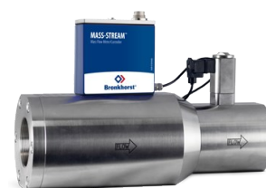
MASS-STREAM D-6391/003BI & D-6491/003BI MFC

Min. flow 40...2000 l/min Max. 100...10000 l/min Pressure rating up to 20 bar Rugged sensor and housing (IP65) Optional integrated TFT display