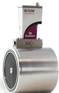
IN-FLOW 'HIGH-FLOW' F-106FI

Min. flow 14 ... 700 m 3 /h Max. flow 140 ... 7000 m 3 /h Pressure rating up to 40 bar Wafer type connection (DIN/ANSI) Rugged IP65 housing