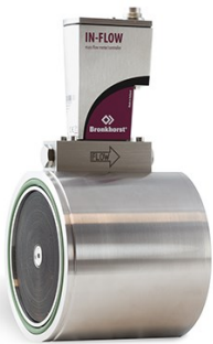
IN-FLOW 'HIGH-FLOW' F-106DI

Min. flow 3,6 ... 180 m 3 /h Max. flow 36 ... 1800 m 3 /h Pressure rating up to 40 bar Wafer type connection (DIN/ANSI) Rugged IP65 housing