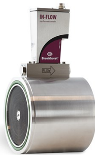
IN-FLOW 'HIGH-FLOW' F-106FI

Min. flow 3,6 ... 180 m 3 /h Max. flow 36 ... 1800 m 3 /h Pressure rating up to 40 bar Wafer type connection (DIN/ANSI) Rugged IP65 housing