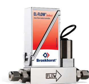
EL-FLOW SELECT F-201CV

Min. flow 0,16...8 mln/min Max. flow 0,5...25 lln/min Pressure rating 64 bar Compact design High accuracy and repeatability