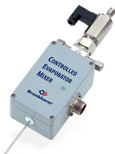
CEM EVAPORATOR W-202A

Min. flow 0,16...8 mln/min Max. flow 0,5...25 lln/min Pressure rating 64 bar Compact design High accuracy and repeatability