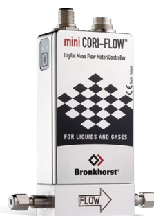
MINI CORI-FLOW™ M12

Min. flow 0,25 ... 5 g/h Max. flow 5 ... 100 g/h Pressure rating 100 bar Compact, IP40 design Analog, RS232 or fieldbus I/O