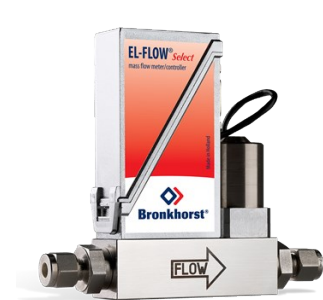
EL-FLOW SELECT F-201CV